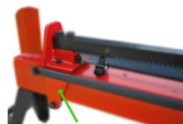
4008019 Push plate assembly