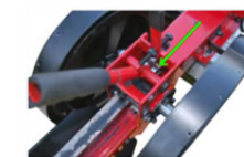
4008024 Handle bearings