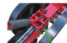
4008023 Pinon mounting bearings