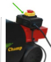
4008025 Power switch