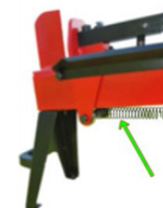
4008020 Return spring