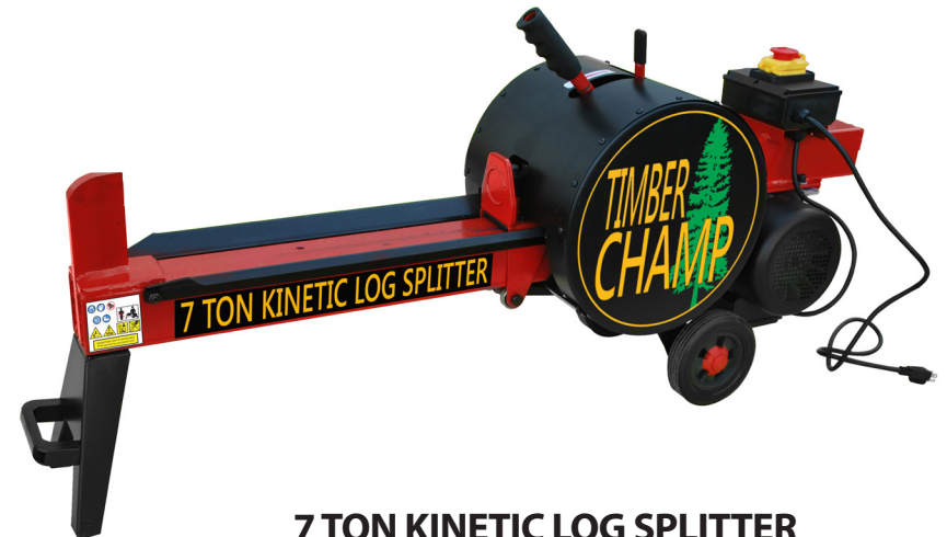
7 TON KINETIC LOG SPLITTER Model No. 4008019 ASSEMBLY & OPERATING INSTRUCTIONS